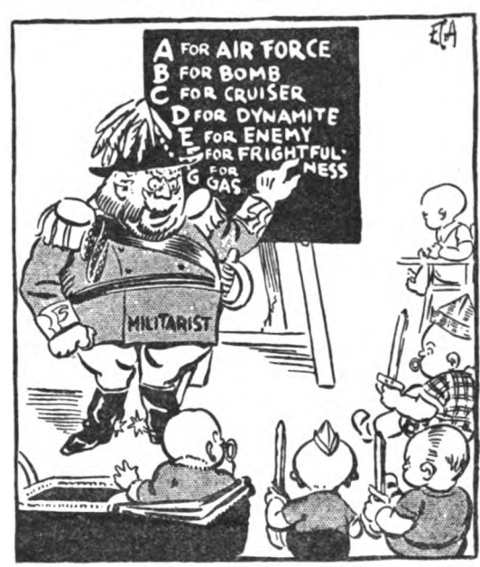
THE MILITARISTS' ALPHABET (from the Educational Worker, organ of the Teachers' Labour League.)

School itself. As far as possible, therefore, preference in the arrangements will be given to those who book early.